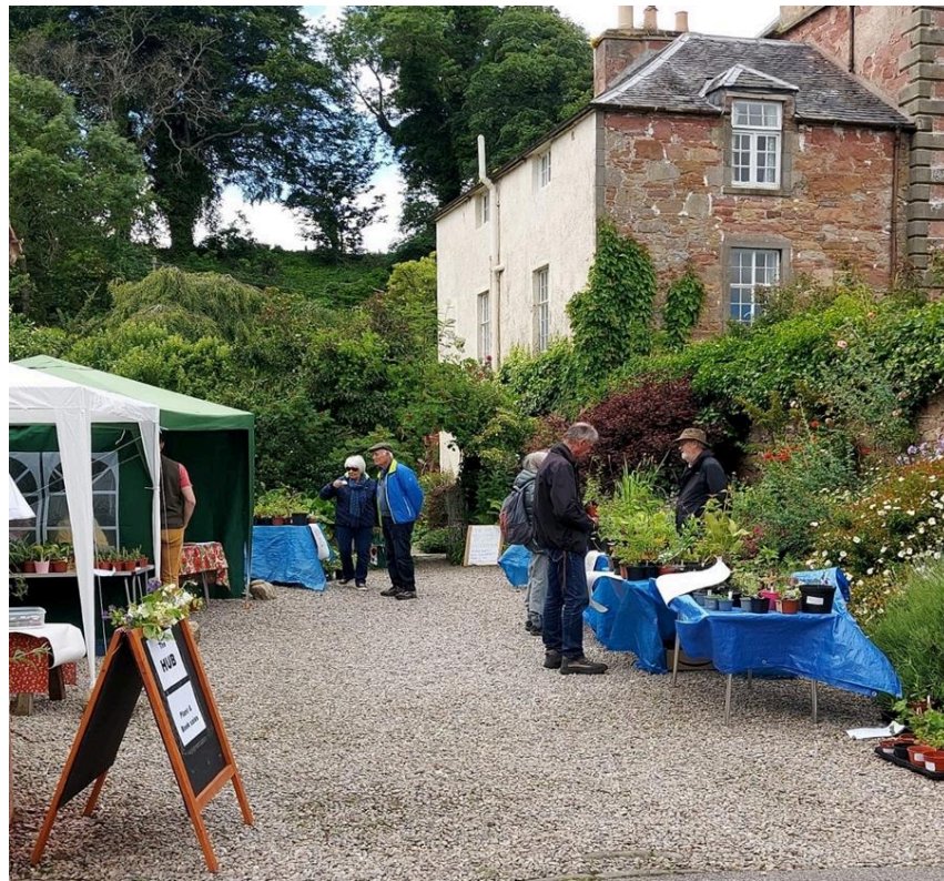
Plant sales at The Hub

As a result of this very successful weekend a sum of £6,500 was raised and, after paying overheads and making provision for 2023, over £5,600 has been distributed to local groups and charities.