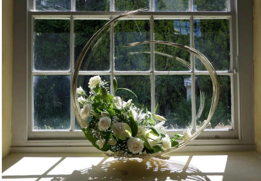
Stunning floral displays in East Church

The Art & Flowers display in East Church added an extra attraction for visitors with beautiful floral displays by members of Cromarty Flower Group and the Ross-Shire Flower Club and botanic artworks by local artists who have been studying at Clunes House, Cromarty. Over 1200 people visited the display in the eight days it was open, a record number.